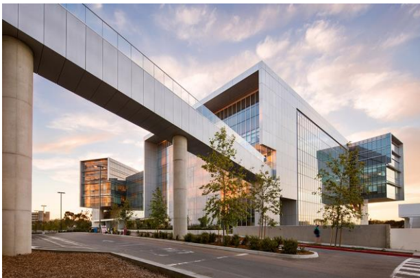
Altman Clinical and Translational Research Institute Building