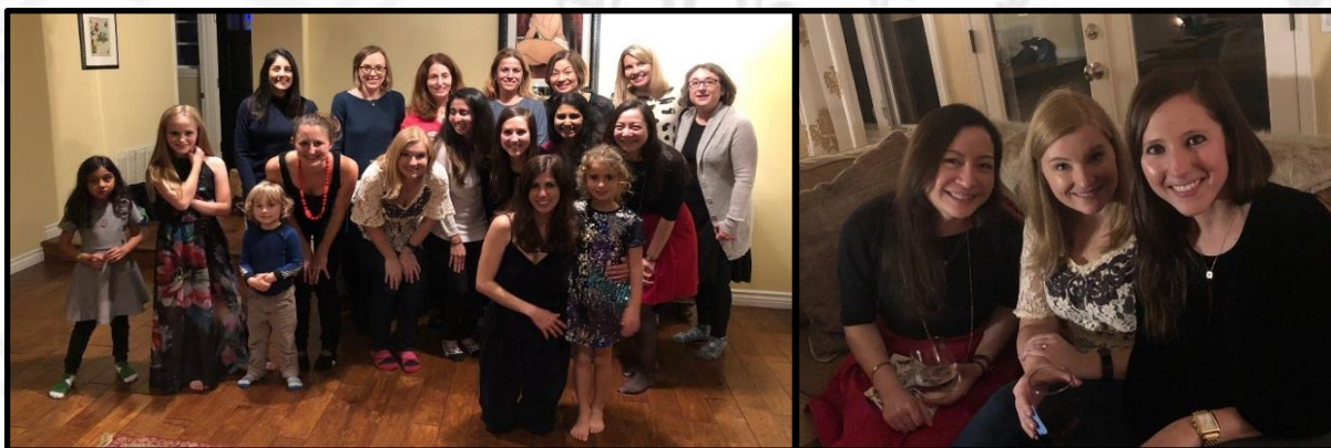
GLOGE Holiday Party, December 2019: