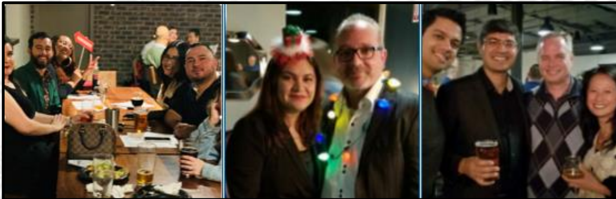
Motility Holiday Party @ Park Commons, December 19, 2019